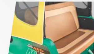
Dual Tone Seats