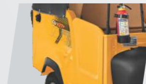
Passenger Safety Door