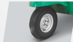
Tubeless Tyres First in 3 Wheeler Segment