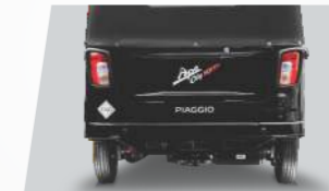
Contemporary Rear Looks