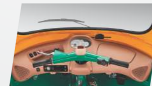
Multi Informative Display