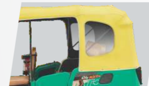
Stylish Hood with Bigger & Transparent Window