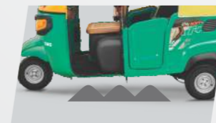
Higher Ground Clearance