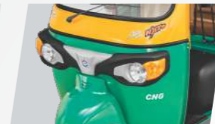
Stylish Front Fascia